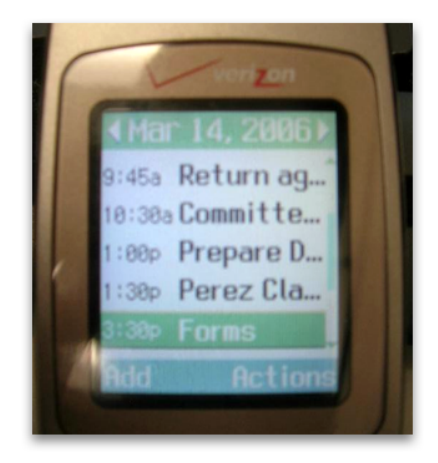
Figure 4: Use of a phone event scheduler and alarms as a portable To Do list manager

home, but when they moved away, they had to adopt a calendar system of their own. Some students started off with "primitive" means of keeping track of their calendars, such as marking to-do's on their hands or scrap pieces of paper. As their to-do lists became longer and their schedules busier, the students had to find another method for managing their information. Some students discovered that the university provided free paper calendars they could use. Figure 3 shows a paper calendar used by a student, note how stickies are used to highlight events.