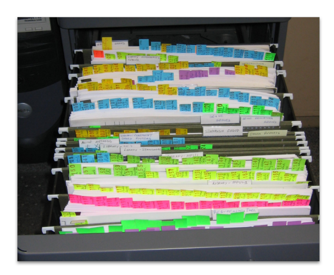
Figure 1: Paper files

and Sidner [26] observed that users leave messages in their inbox as reminders for future processing. In all, 'piling' served a valuable reminding function.