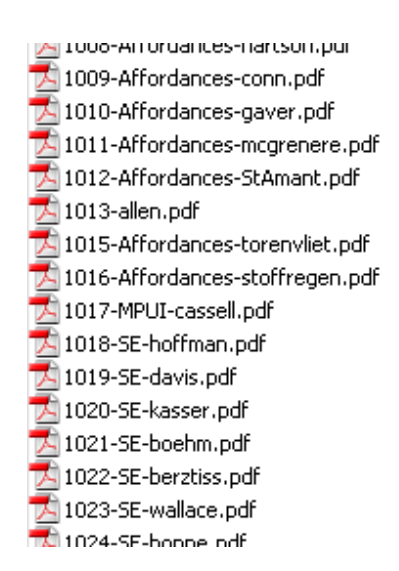
Figure 2: PDF documents

As seen before, some people file information to help them in refinding information at a later date. One student had an interesting