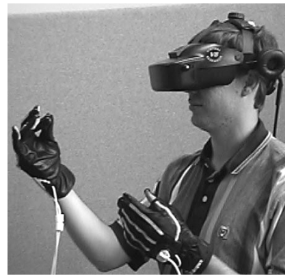
Figure 1. User wearing HMD and Pinch Gloves™

have improved, but may require system training, are susceptible to errors due to environmental sounds, and are cumbersome to use one letter at a time, which would be required for typing non-words such as filenames. "Virtual" or "soft" keyboards [6], such as those used on PDAs, can be implemented in an immersive VE using the "pen & tablet" metaphor [1]. A keyboard layout would be displayed on the surface of a virtual tablet (corresponding to a physical tablet) and selected with a virtual pen (corresponding to a physical pen). Such a technique requires the user to hold two devices, however, and does not take advantage of touch-typing skills.